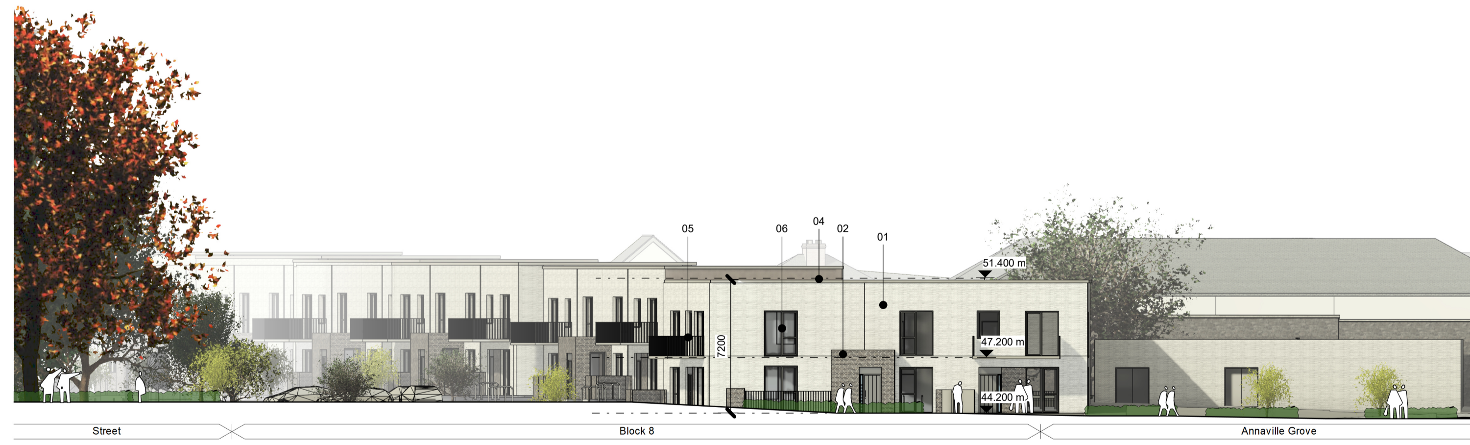
North Elevation 1 : 200

Notes: - Do not scale from this drawing. Use figured dimensions in all cases. - Verify dimensions on site and report any discrepancies to the Architect immediately. - This drawing is to be read in conjunction with the Architect's Specification. - © This drawing is copyright and may only be reproduced with the Architect's permission.